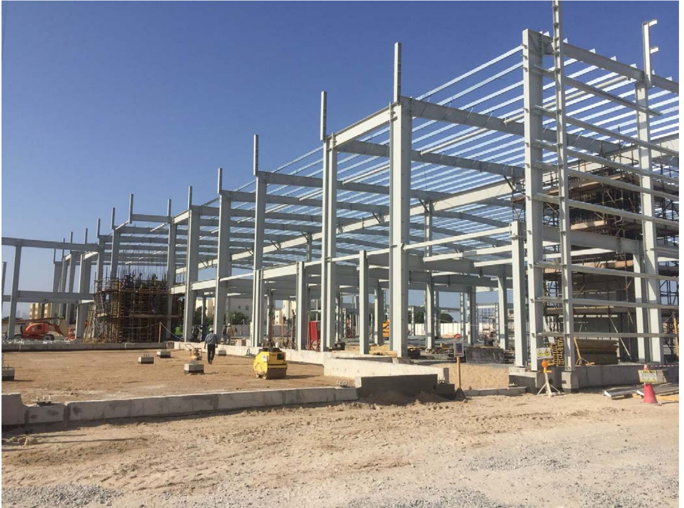
W - MOTORS (SILICON OASIS , DUBAI)