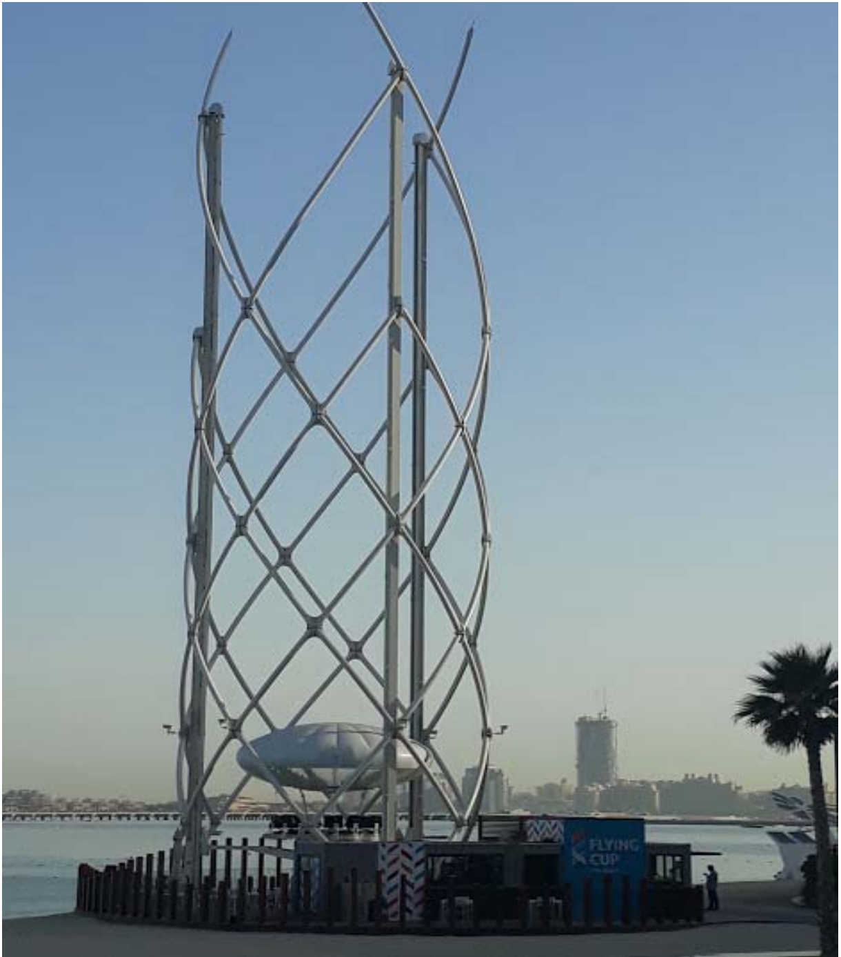
FLYING CUP RESTAURANT