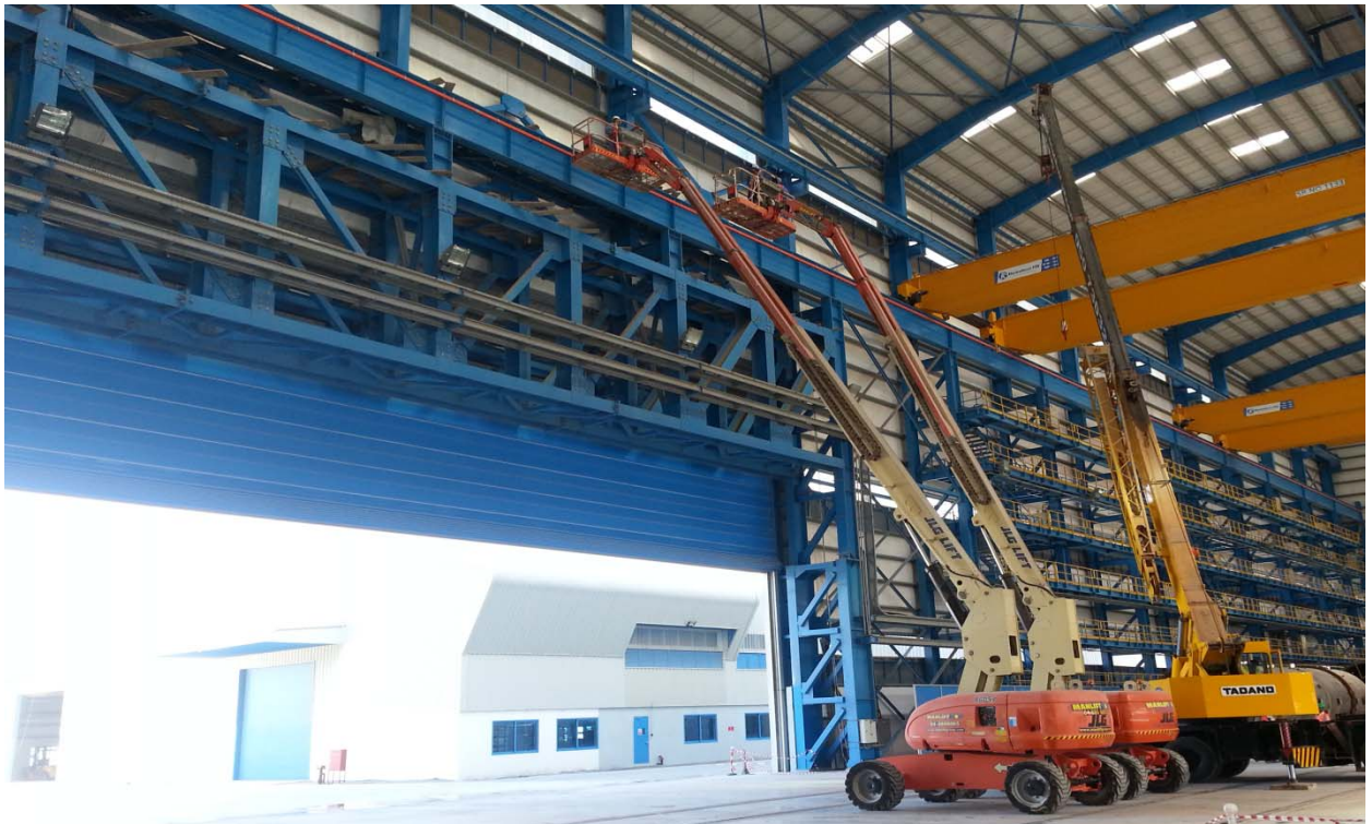
STRUCTURAL WORKS – AIR LIQUIDE, RAK