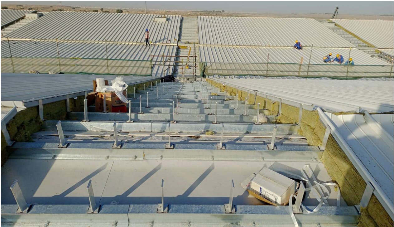
STANDING SEAM ROOF SYSTEM ( ETIHAD RAIL )