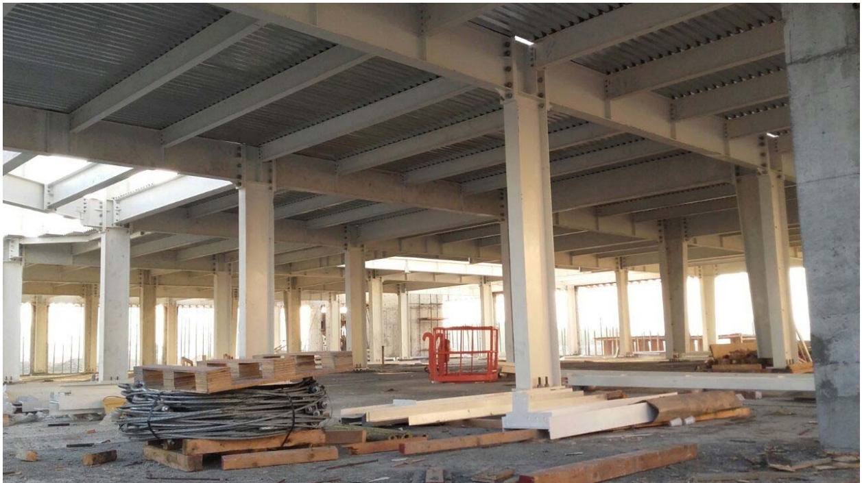
RAK MALL – ERECTION IN PROGRESS