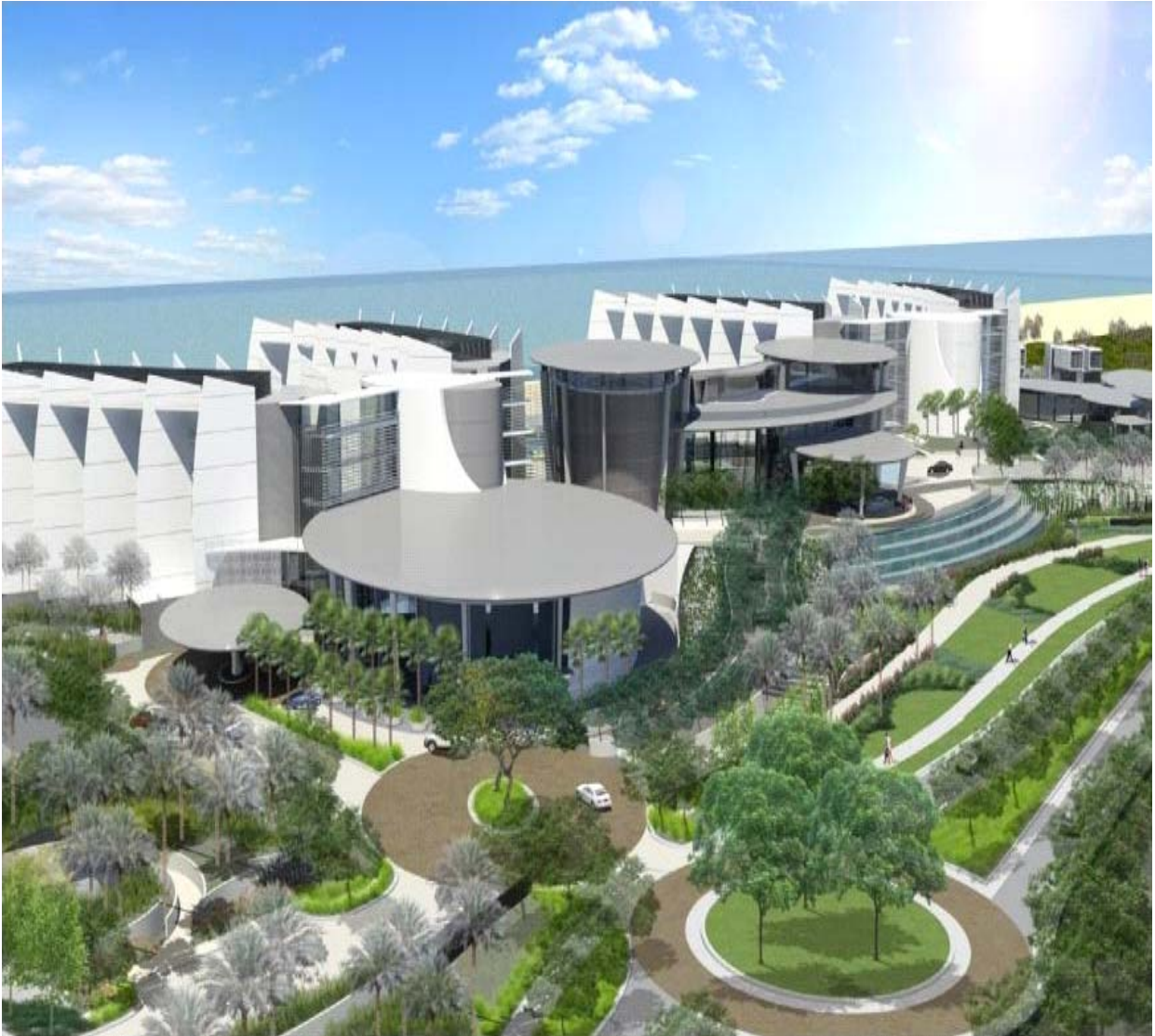
STANDING SEAM ROOF – SAADIYAT ISLAND RESORT