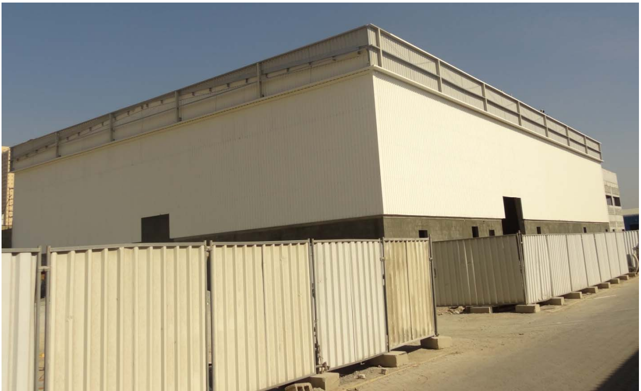
ROOF & WALL CLADDING INSTALLATION – MABANI STEEL