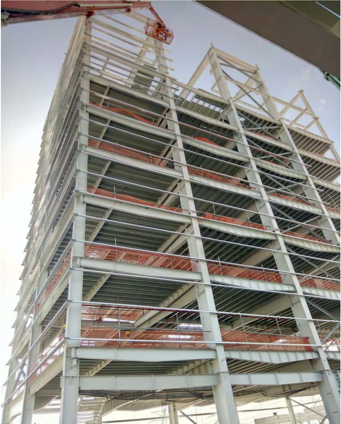
40MTR STEEL TOWER AOL JEBAL ALI