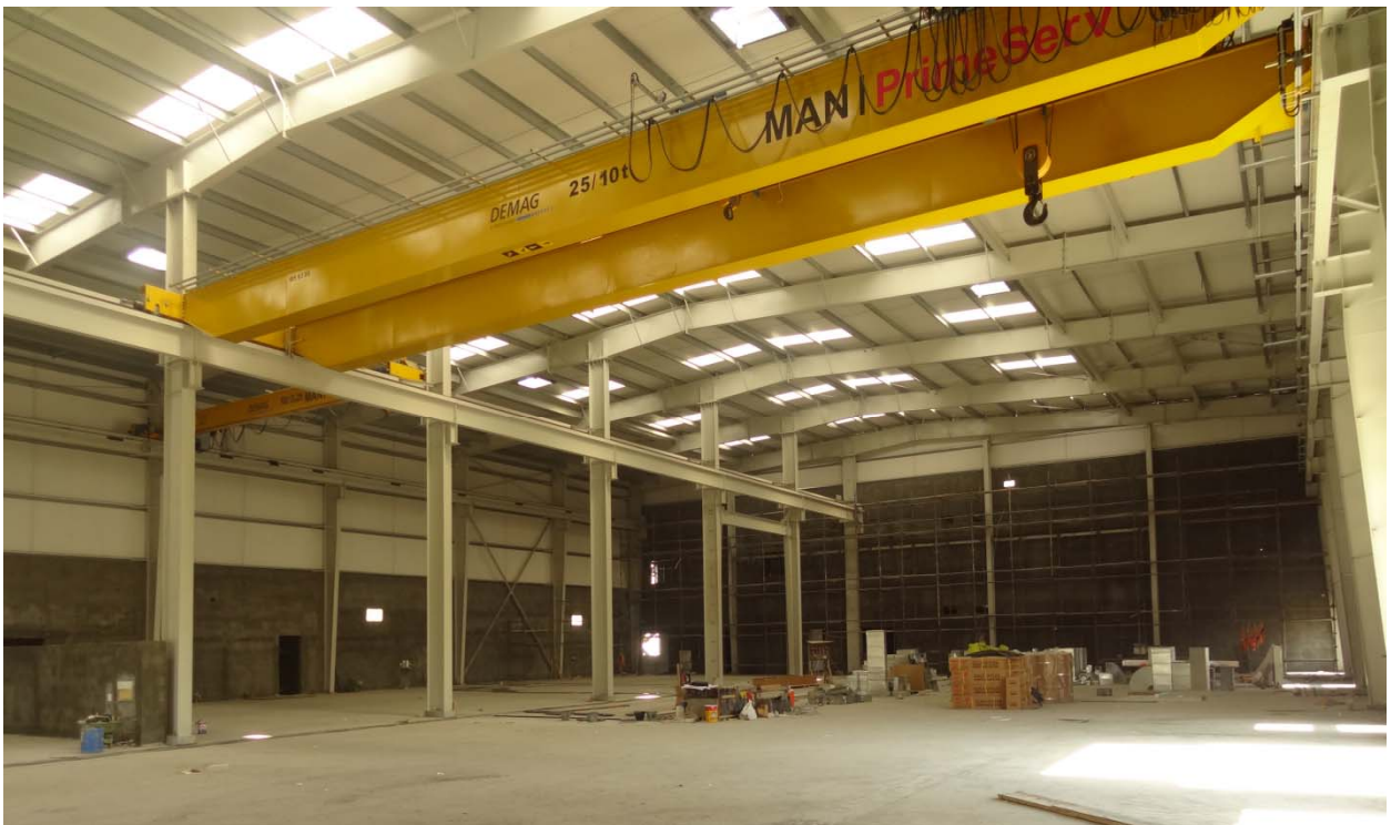
STRUCTURALSTEEL INSTALLATION – MAN DIESEL